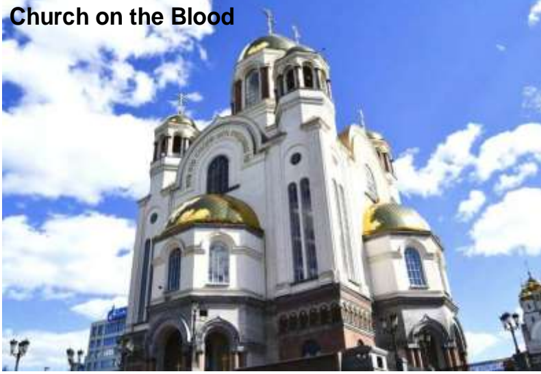
Church on the Blood