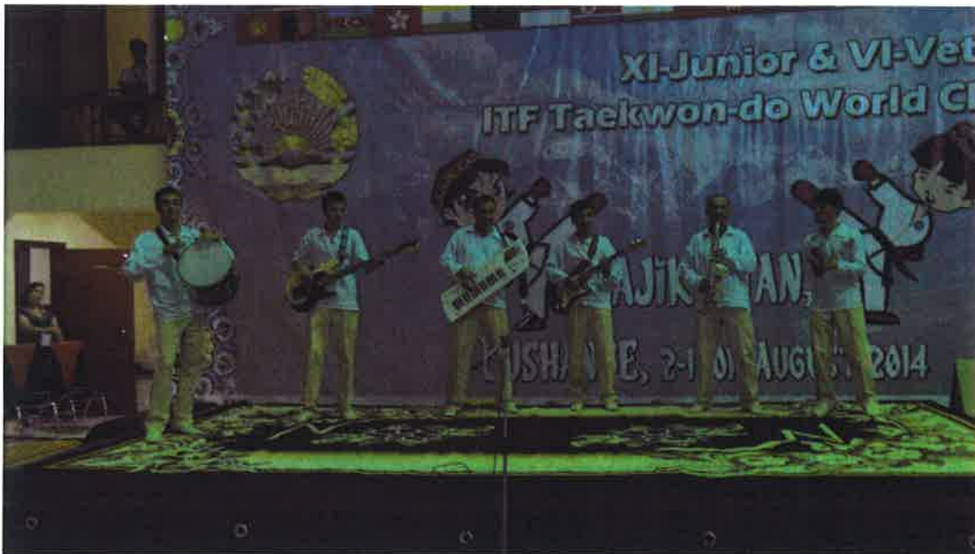
The Competitions took place in "Elite Sport Arena" in Dushanbe.