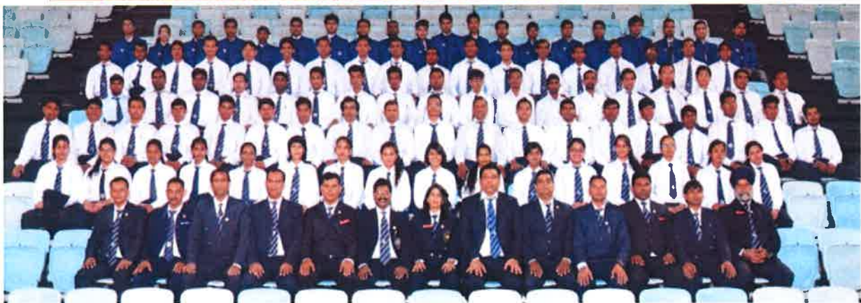
OFFICIALS OF 26TH DELHI STATE JUNIOR & SENIOR AND 10TH SUB-JUNIOR ITF TAEKWON-DO CHAMPIONSHIP