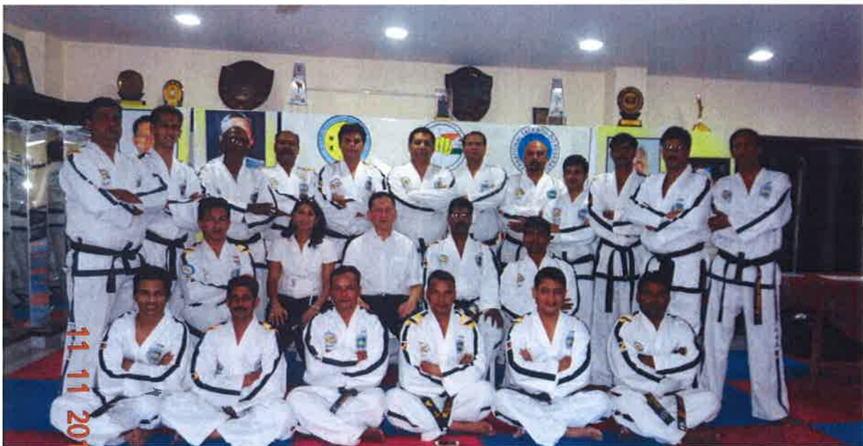
INTERNATIONAL INSTRUCTOR COURSE & INTERNATIONAL UMPIRE COURSE 18-21 SEP 2014 & 11-12 NOV 2014 - GOA & NEW DELHI