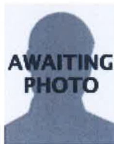
Special Needs Committee: -to be elected-